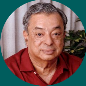
Dr. Verghese Kurien

A newsletter of Anandalaya, Mar-Jul, 2020 : Issue - 12